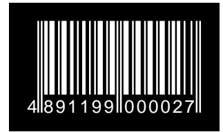
#4 Negated barcode