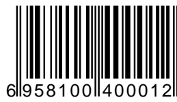
#2 Simple barcode