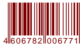
#3 Colored barcode